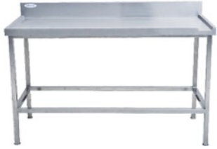
Marine SUS Working Table