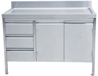
Marine SUS Working Cabinet