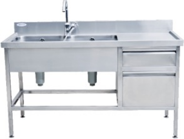
Marine SUS Working Sink